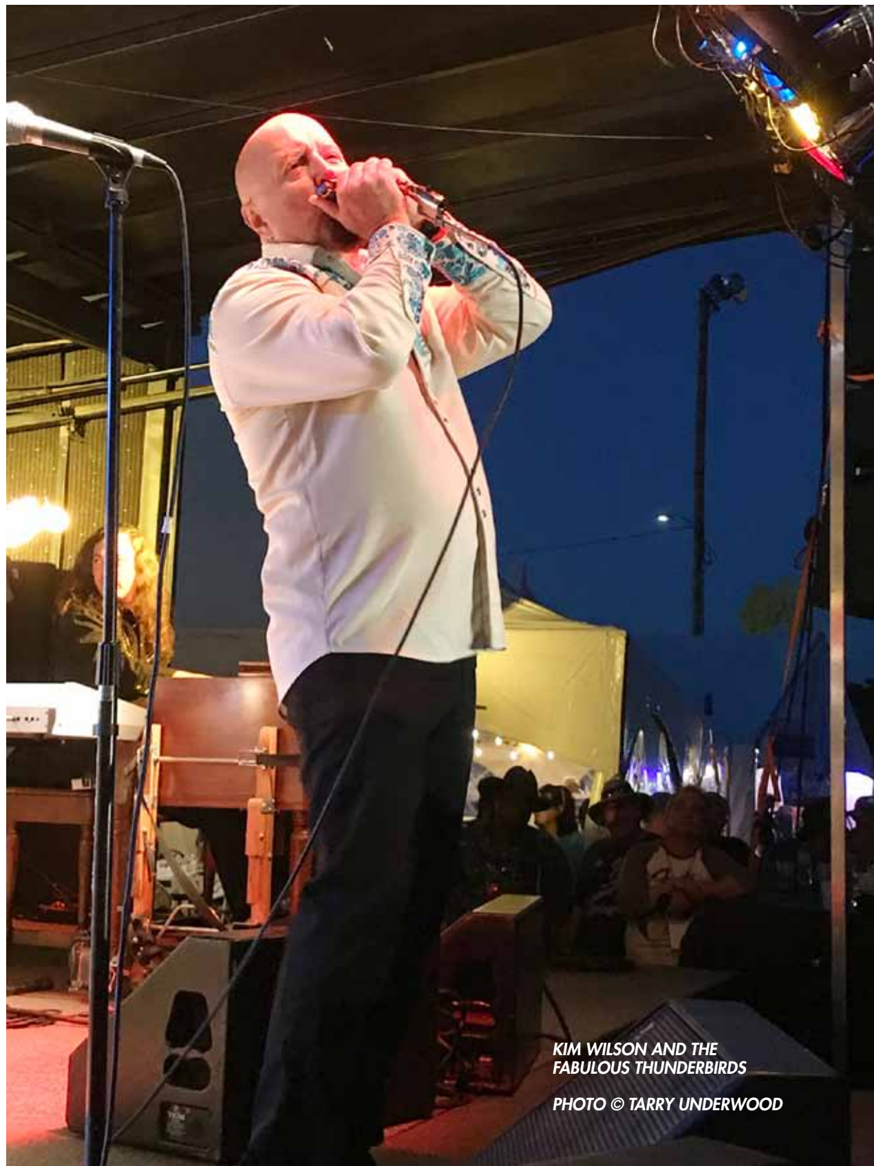
KIM WILSON AND THE FABULOUS THUNDERBIRDS