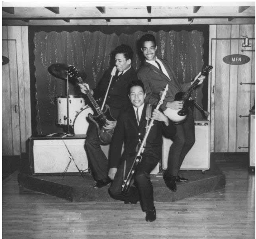
THE KING KASUALS IN NASHVILLE