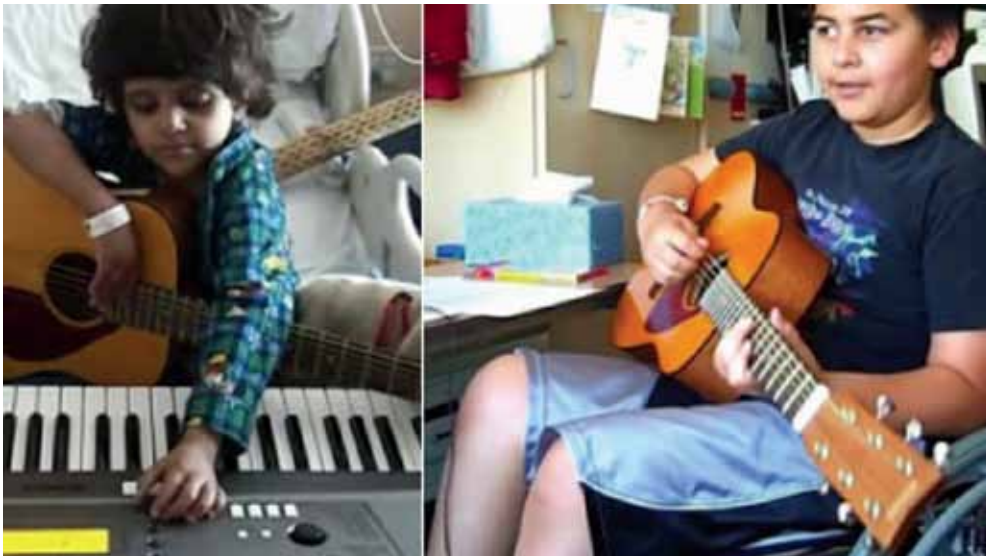
CHILDRENS HOSPITAL OAKLAND

The Colorado Blues Society is a proud supporter of Blue Star Connection. Donate to Blue Star today!