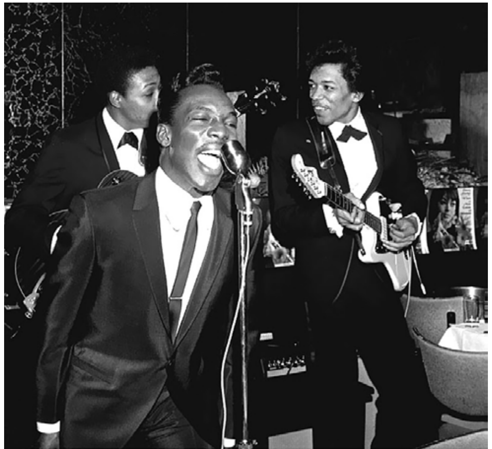
JIMI HENDRIX BACKING UP SOUL LEGEND WILSON PICKETT IN NEW YORK CITY, MAY 1966

Jimi Hendrix was a bluesman who became a rock guitar legend. At the time of his death he was on the verge of recording with trumpeter Miles Davis. Who knows what kind of music he'd be playing today?