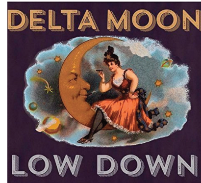
Delta Moon LOW DOWN Jumping Jack Records