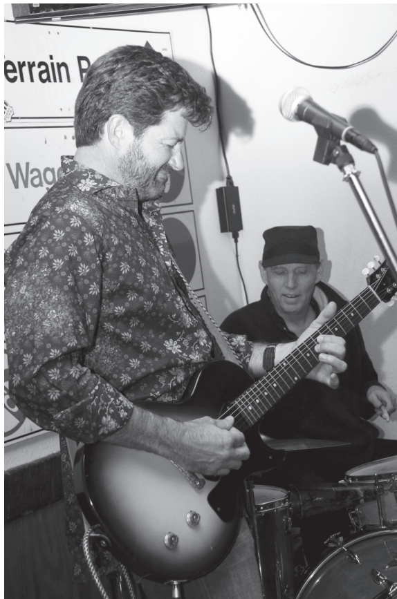
TAB BENOIT, 2009 BLUES FROM THE TOP