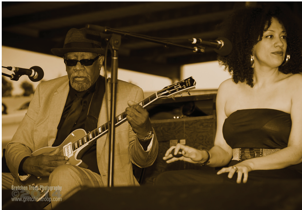
HERITAGE BLUES ORCHESTRA, GREELEY BLUES JAM

Spirit Lake Blues Festival Grand Lake, CO