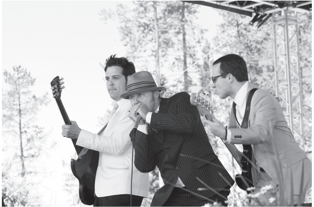
JOHN NEMETH AND BAND, 2009 BLUES FROM THE TOP